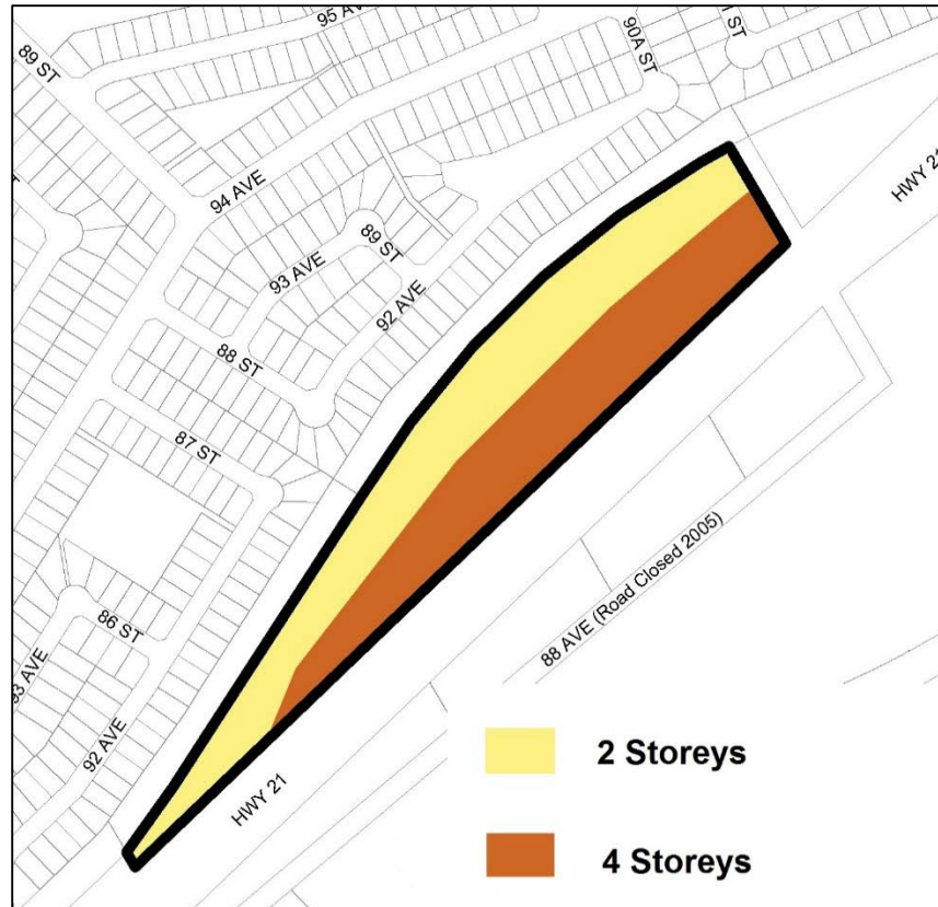
Figure 9.12a Maximum Building Height Diagram