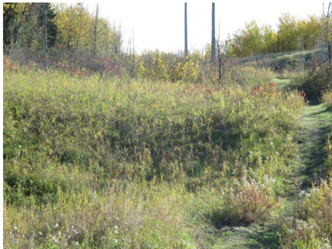
Partly completed restoration plot, on slope, "Second Hollow." Weedy slope requiring eventual restoration.