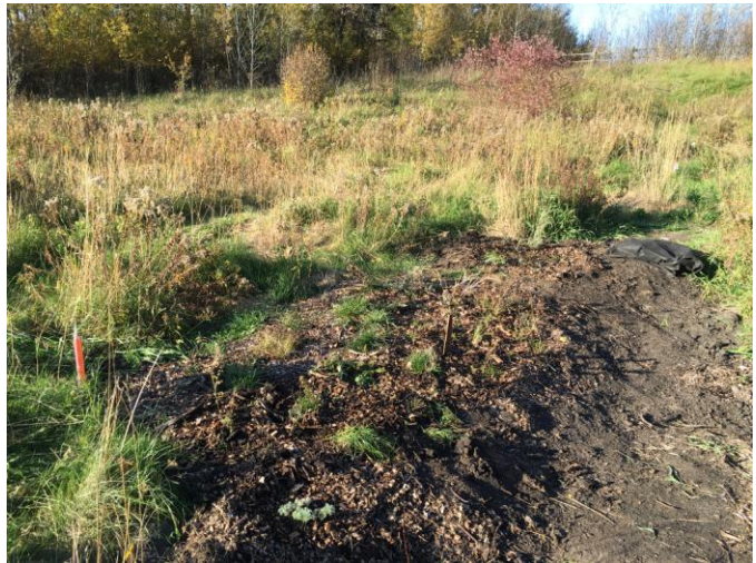
Restoration plot in "First Hollow" (Sept. 27, 2016)