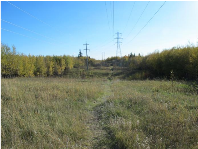
Fort Saskatchewan Prairie looking south (Sept. 27, 2016)